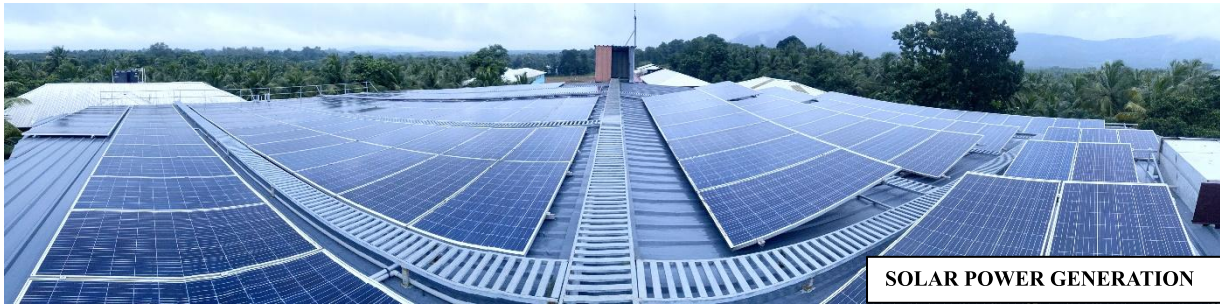
SOLAR POWER GENERATION