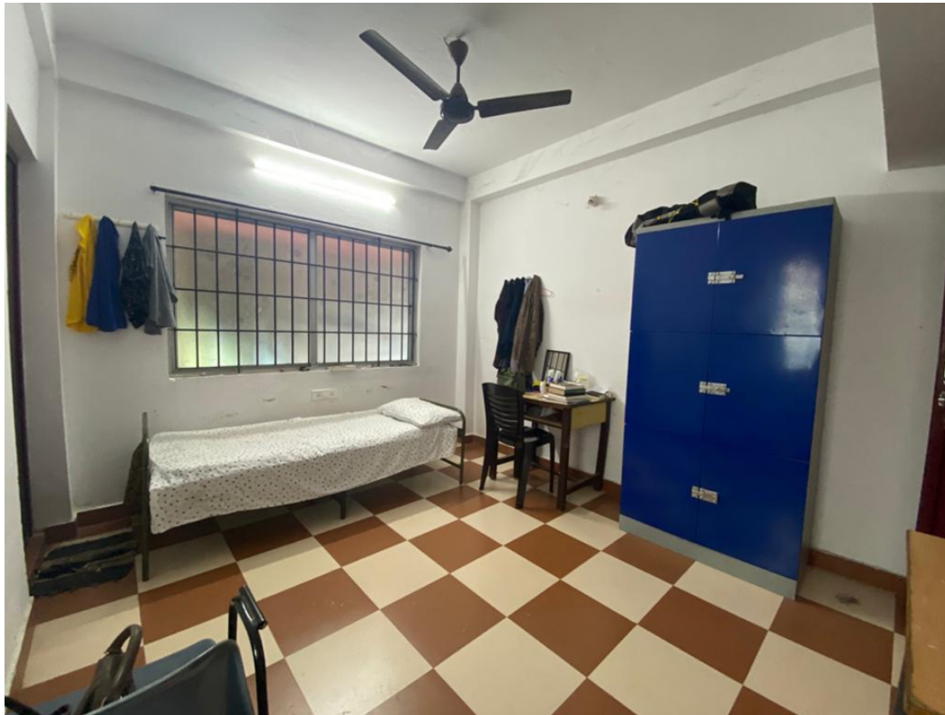
Figure 8.6 View of a Hostel Room

The Hostel has a well-equipped Gymnasium, Recreation facility , Indoor games, washing machines all of which are accessible 24 x 7. A vehicle is provided exclusively for the usage of the hostellers to cater to any emergency need for transportation. The institute boasts of a majestic 10 m. X 13 m. long Swimming pool to let the students and faculty cool off the heat and stress of academics.