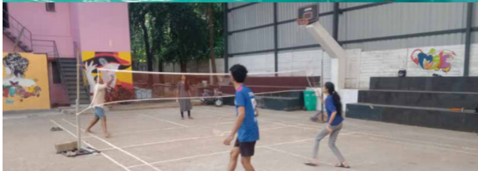
View of the Indoor and Outdoor facility