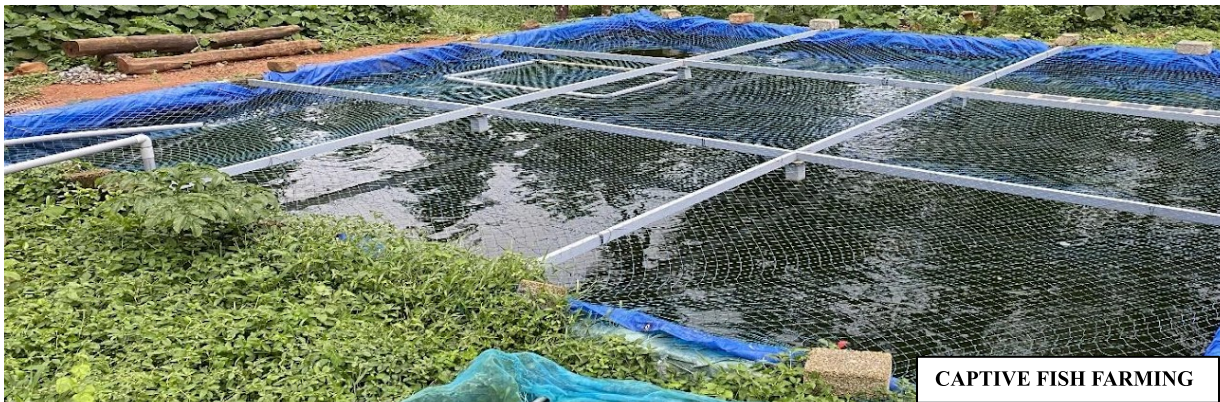
CAPTIVE FISH FARMING